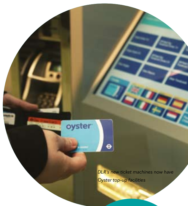
DLR's new ticket machines now have Oyster top-up facilities

Over 85% of DLR passengers now use Oyster. If you use Pay as You Go, please make sure you get the cheapest fare by touching in at the start of your journey and touching out at the end.