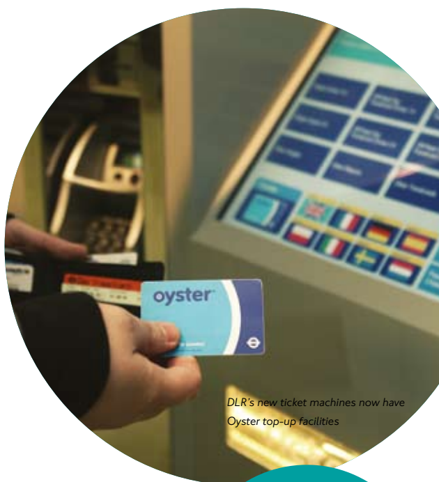
DLR's new ticket machines now have Oyster top-up facilities

Over 85% of DLR passengers now use Oyster. If you use Pay as You Go, please make sure you get the cheapest fare by touching in at the start of your journey and touching out at the end.